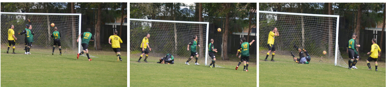
MEADY's header from another corner kick goes wide ... poor LUCA.