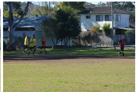
WYONG get their 2 nd in the final minute of the first half.