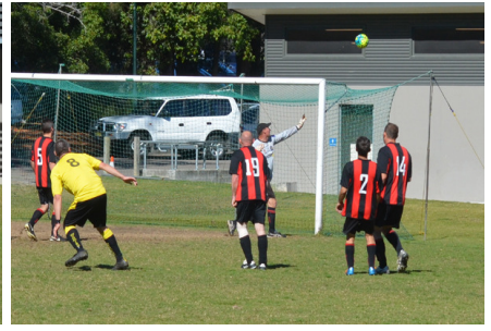
LUCA takes a shot.