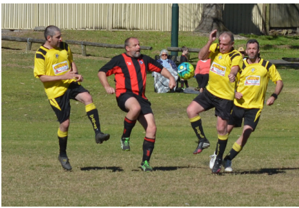
This Week's Top 3 Movers & Shakers (Proudly Sponsored by Gregg's School of Dance)