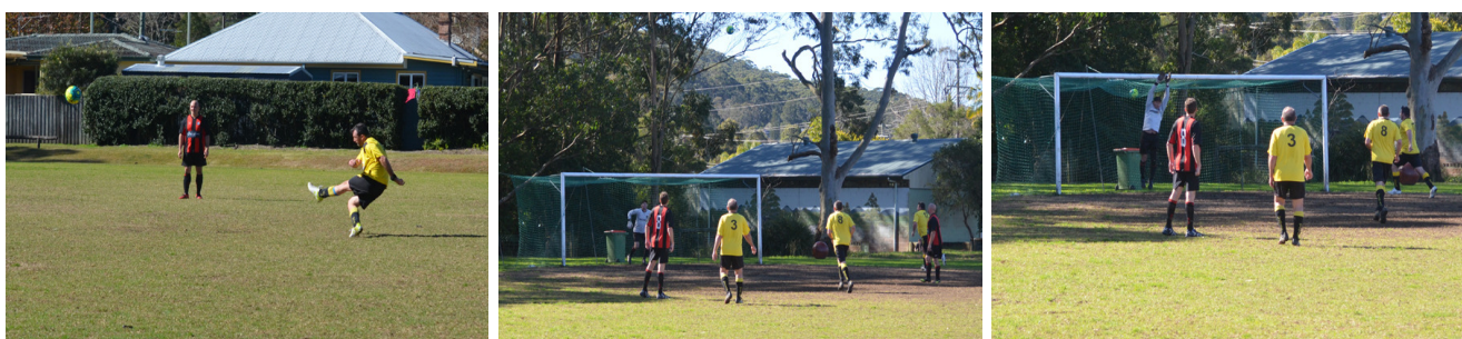
ANDY's free kick.