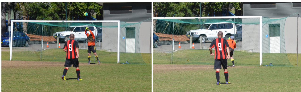
AARON's quick reflexes get him out of trouble.