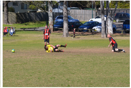
a shape of things to come ...