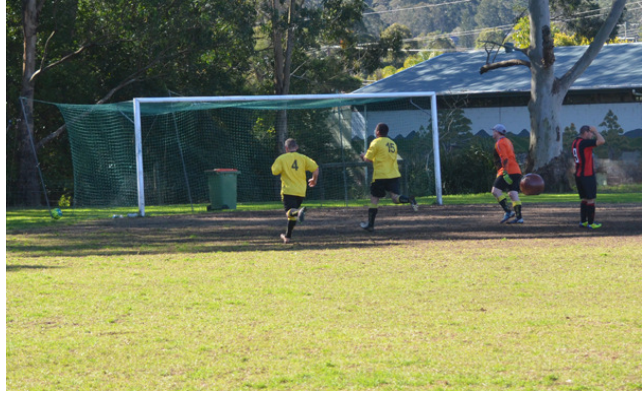
Wyoming survive a close call.