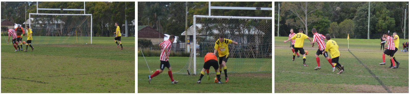
STEW takes on Meady's usual position and almost does a typical Meady-styled play by nearly knocking out Aaron