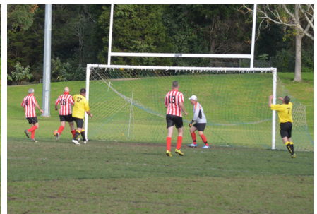
FORDO comes agonisingly close !!