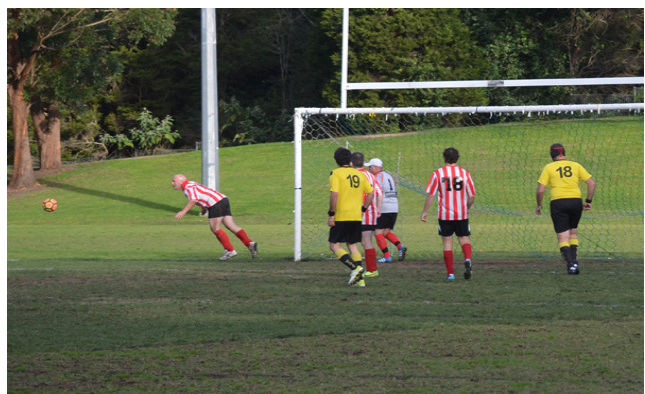
LUCA's free kick gets blocked.