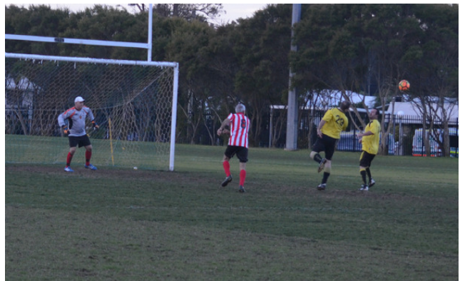
MEADY almost gets to an ANDY cross.