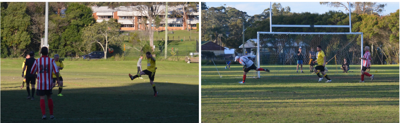
STEW puts up the bomb.