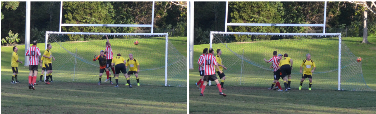
WYOMING survive a dangerous cross.