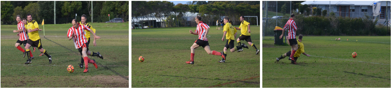
MEADY in pursuit: "Oh no, not again!"