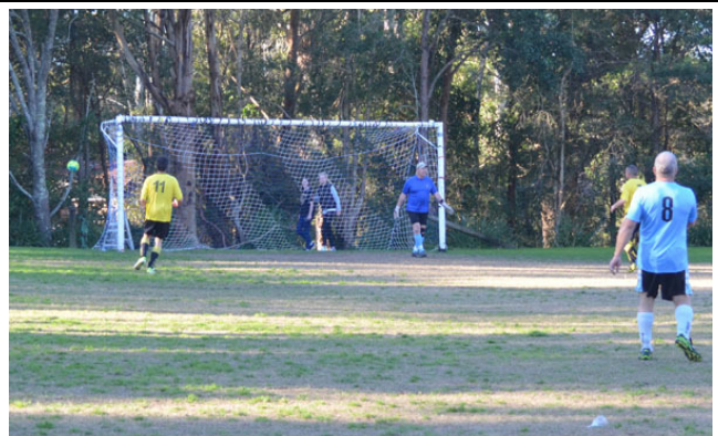
The offside STEW takes a shot.