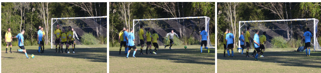
BERKELEY hits back several minutes later.

The joy was short lived however when a free kick was conceded just outside Wyoming's box. The ensuing shot curled around the wall and that was that, the score was level.