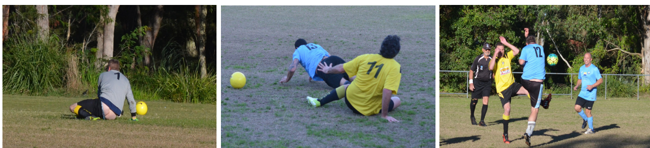
A full moon on the rise / ANDY preventing another one? / STEW aims for the wrong ball(s) ?