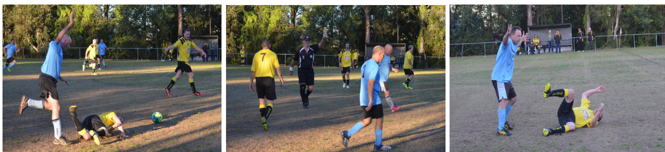
FORDO gets some help in picking up the dirty shirt points today.