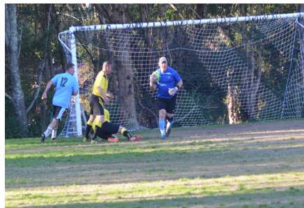
STEW on a collision course.