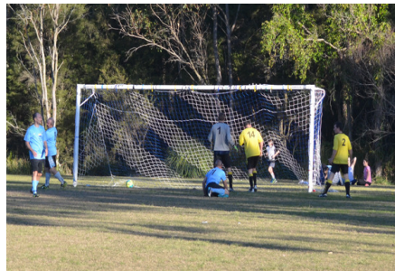
BERKELEY's 2nd & 3rd goals.