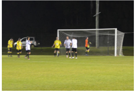
KILLARNEY's first goal