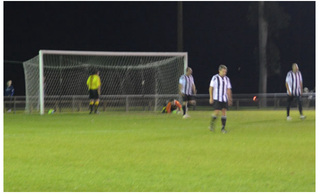
KILLARNEY puts us to the sword.