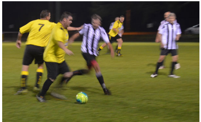
FORDO becomes very protective of KENNY