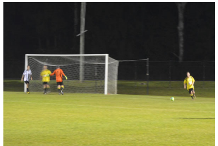
Desperate defence stops a second.