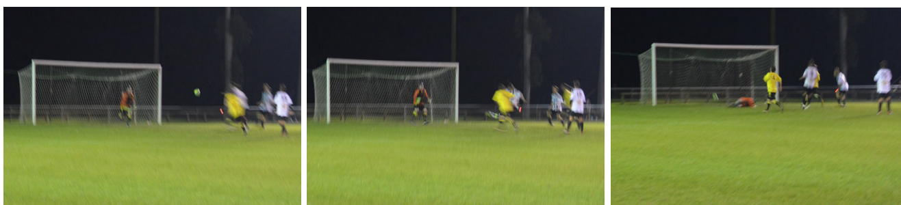
KILLARNEY's second goal