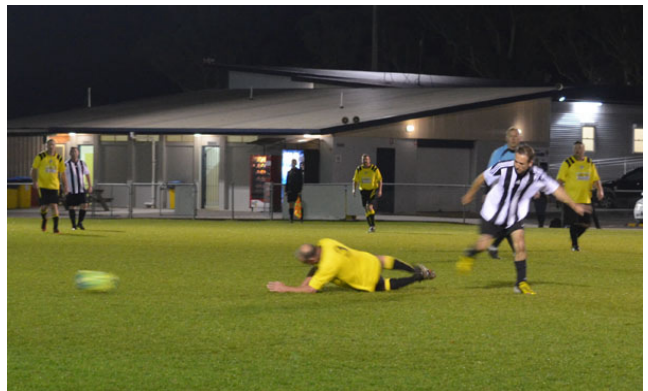
MEADY gets some TLC treatment at half time / GREGG picking up some more dirty shirt points.