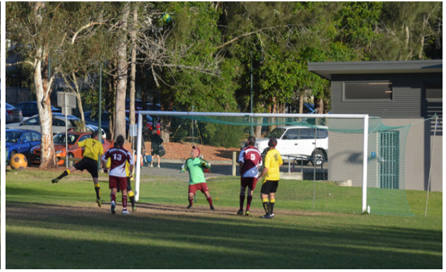
FORDO takes things head on after an ANDY cross.