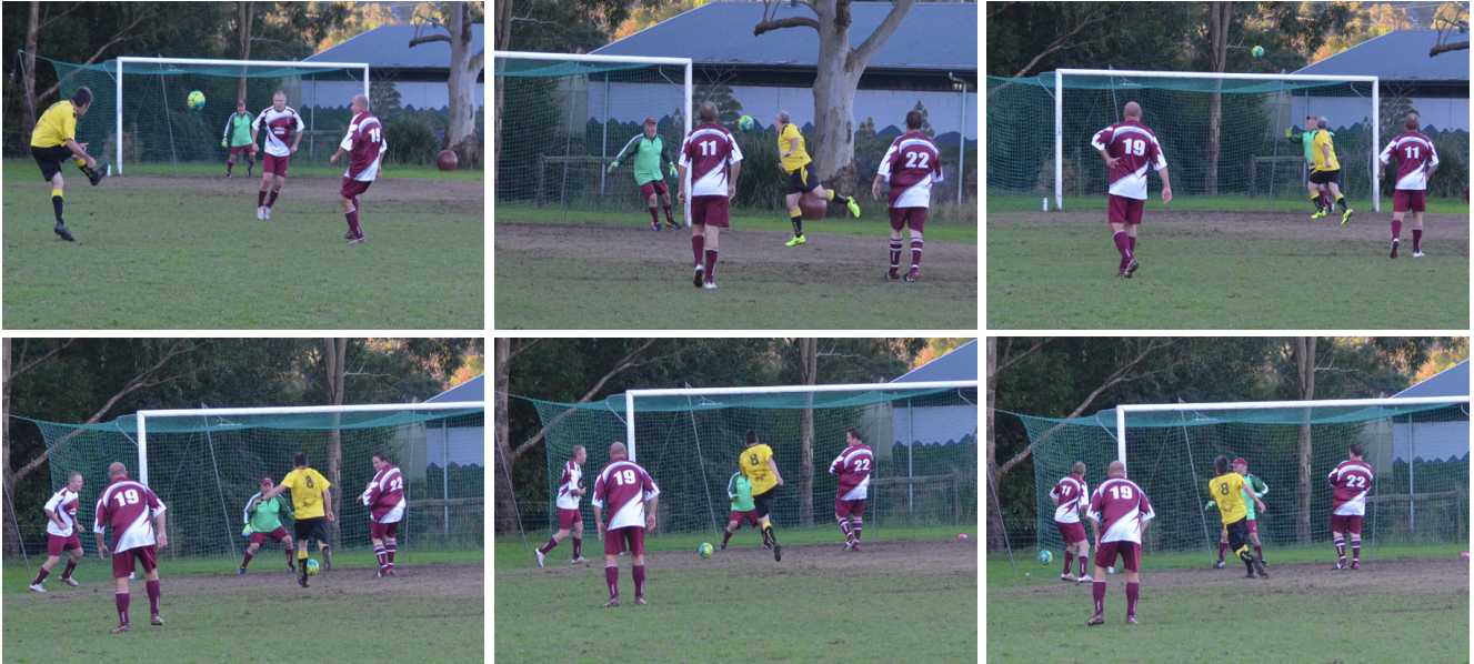
CHRIS's heads LUCA's pass into the crossbar, LUCA's ensuing shot goes wide ☹️