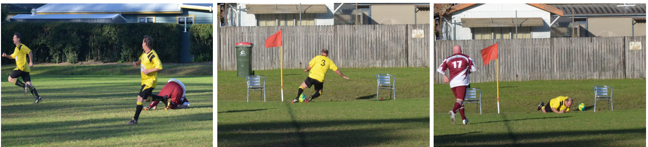
The Invisible Sniper does not discriminate.