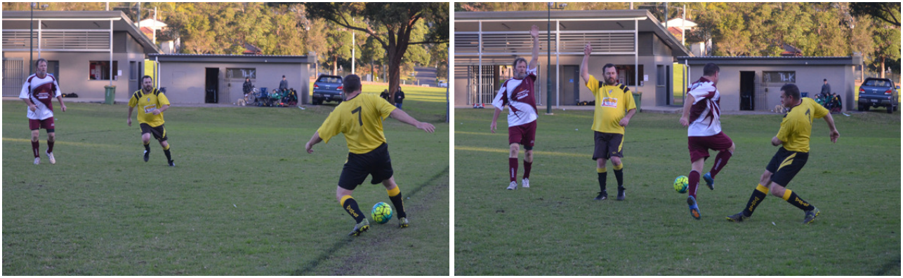
"Out!!" Double dobbers won't let Fordo play on from the sideline.