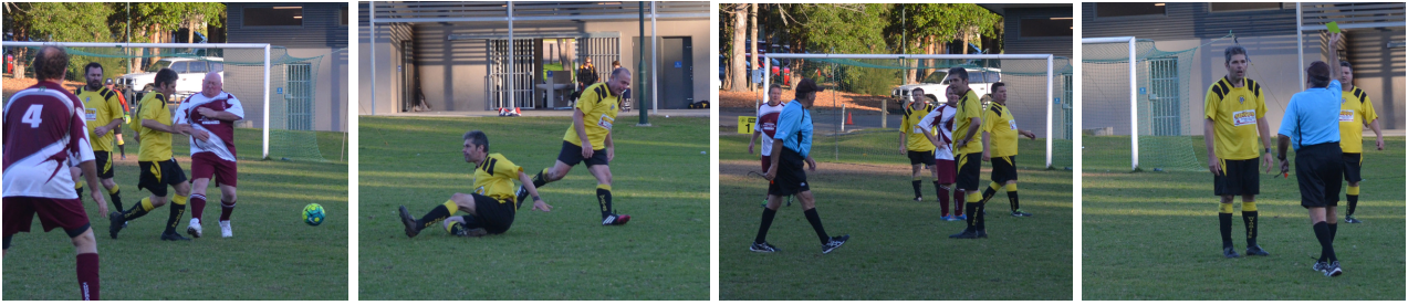
LUCA the disbeliever