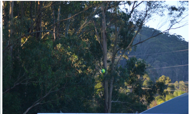
LUCA takes an ambitious shot.