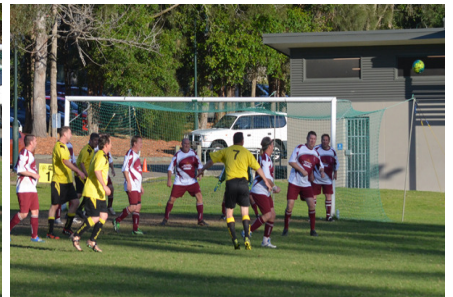
STEW attempts a header shot from an ANDY corner kick.