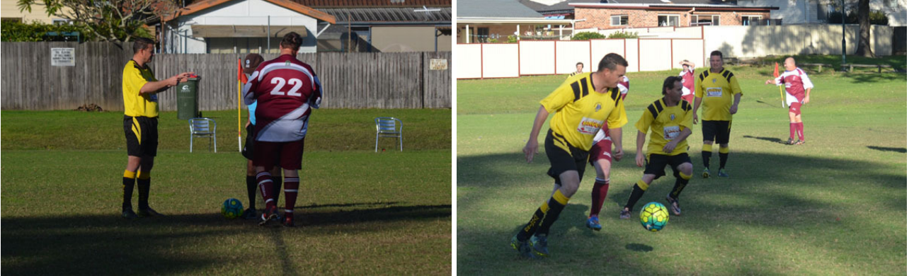
FORDO wins the toss but chooses to run in the opposition direction to the one advised.