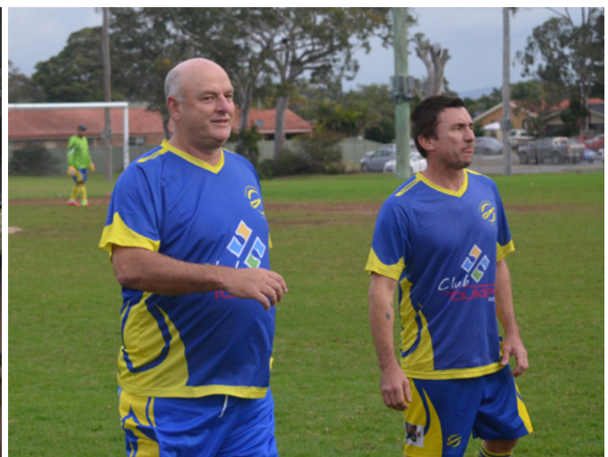
LUCA partying in MELBOURNE / FRAMEY turns up in yellow ... but also blue ☺