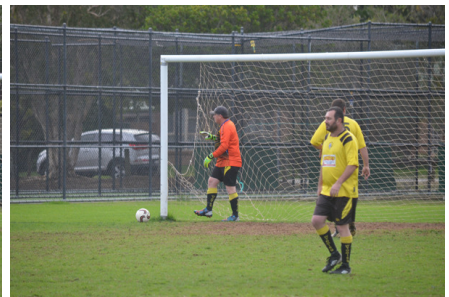
TOUKLEY takes a very early lead