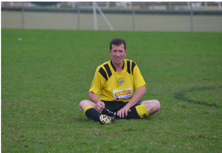
Yoga sessions during the game ?