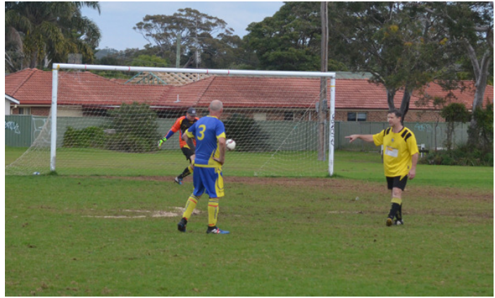
Too soon MEADY to be making jokes about the surface