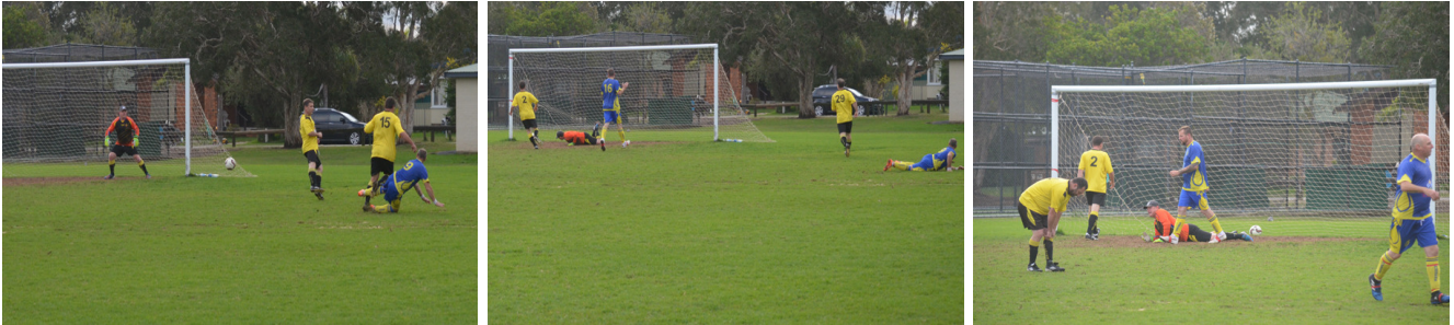
Toukley's third goal.