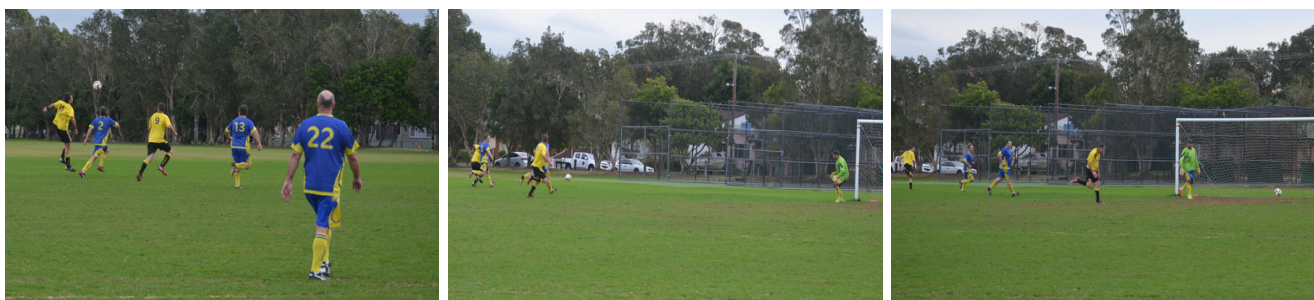
ANDY makes an attacking run and cross.