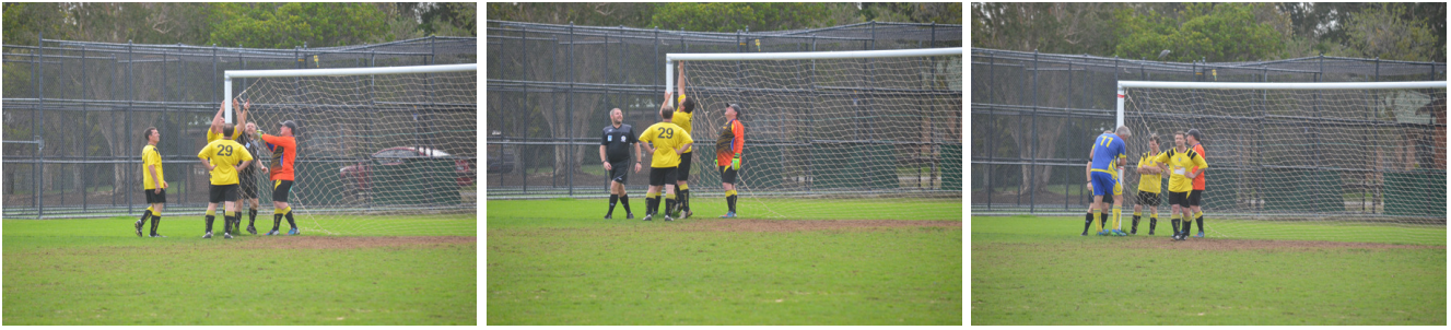
Time delaying tactics as the net needs to be fixed.