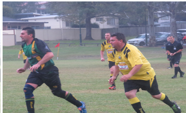
Trying to escape the rain