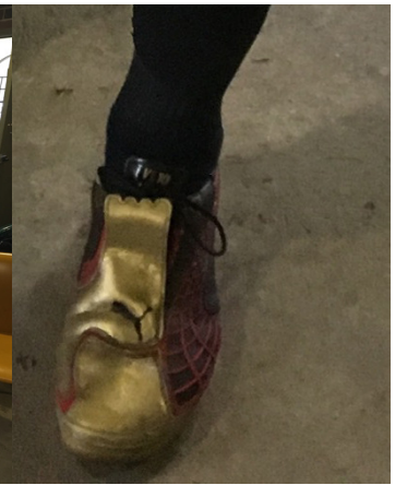
MEADY tries to win something at least / GREGG's steps up his claim for the golden boot.