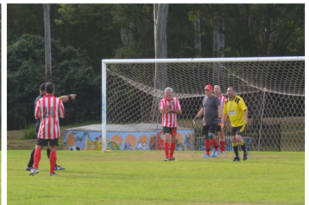
LUCA sets up BRAD for a shot.