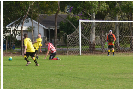
More solid defence from MEADY