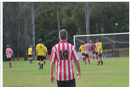
WYOMING hopeful that this would TERRIGAL's last shot.