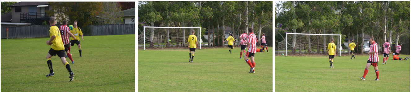
TERRIGAL hits the lead