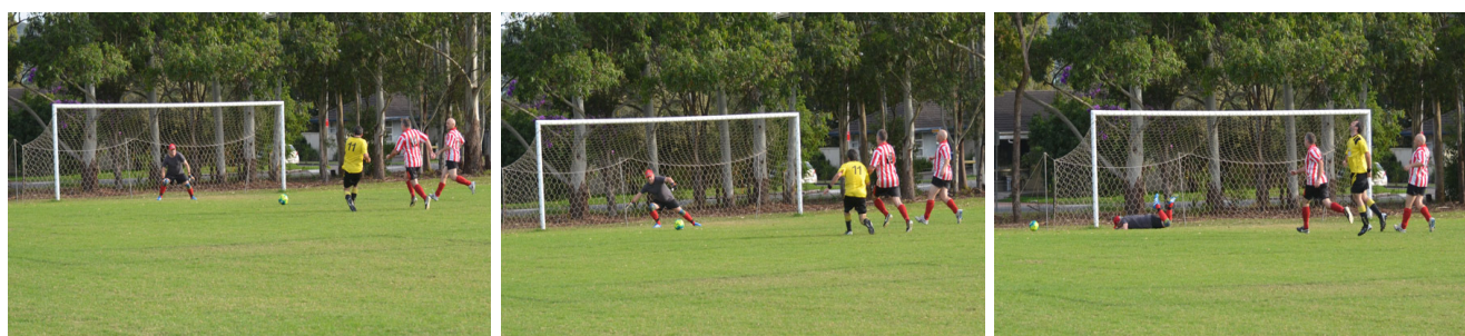
ANDY narrowly misses from a COTTIER pass.