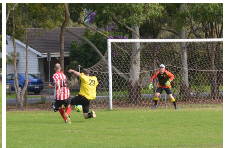
MEADY stops an early threat.