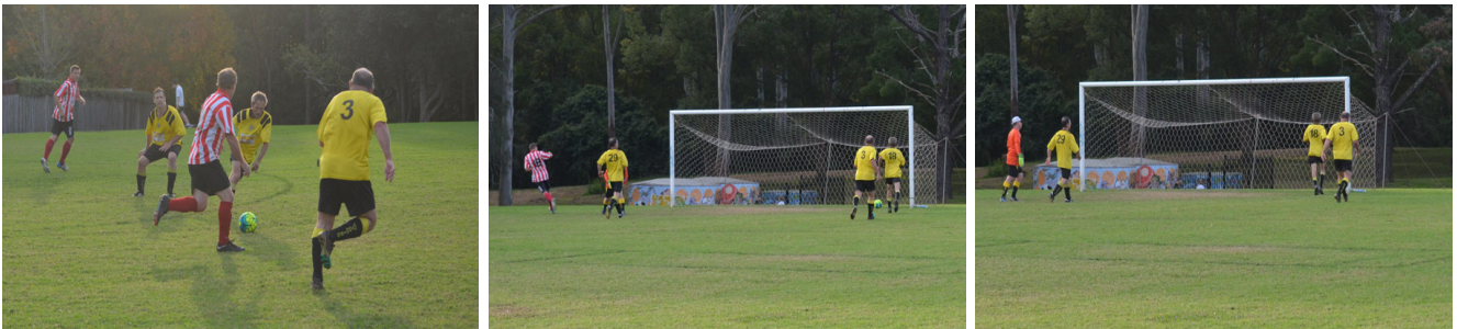
The final crushing blow with a minute remaining.