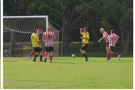
FORDO's missed opportunity