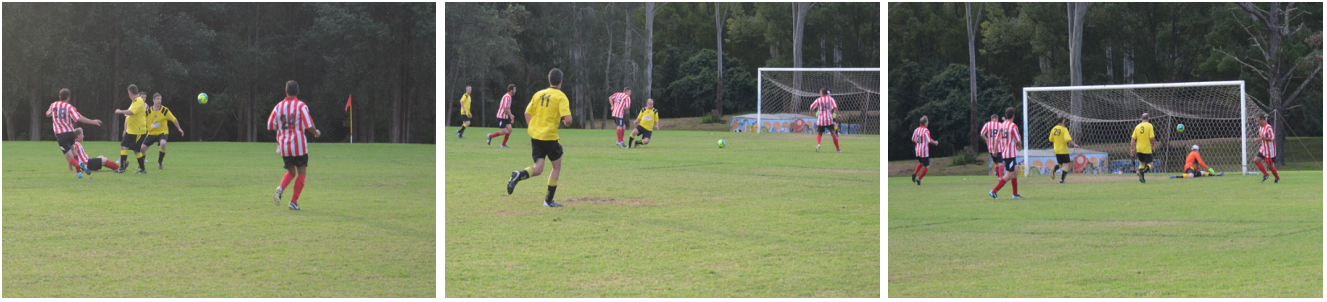
TERRIGAL takes the lead despite an offside play.