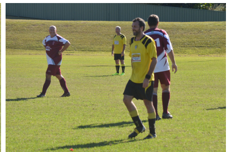
Not all doom and gloom