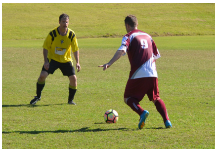
NIGEL VS NIGEL