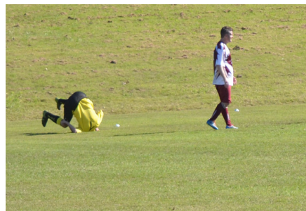
Too much FORDO momentum