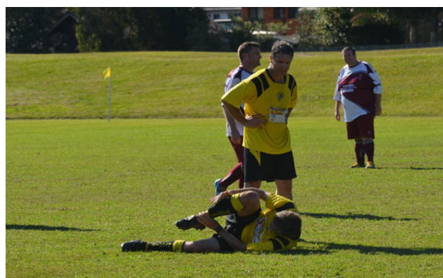
MEADY looks at LUCA knowing full well he's going to have to buy another box of laundry detergent on the way home.