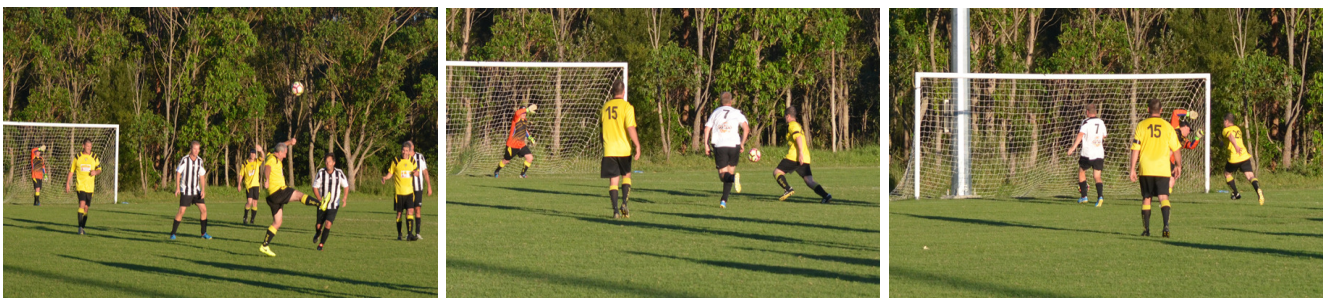
KILLARNEY capitalises on a WYOMING mistake.