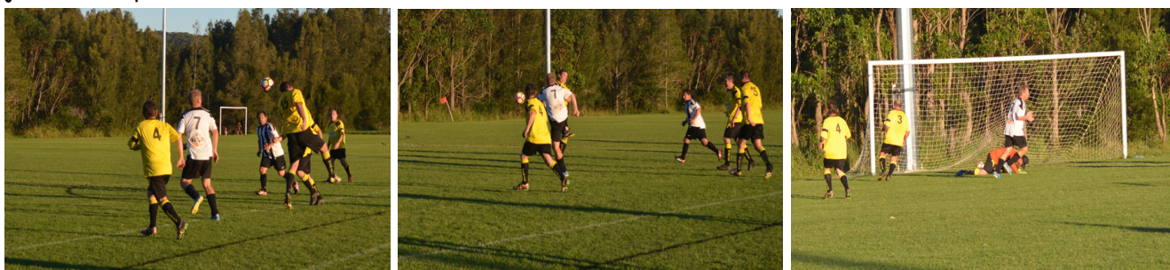
KILLARNEY capitalises on a WYOMING mistake.