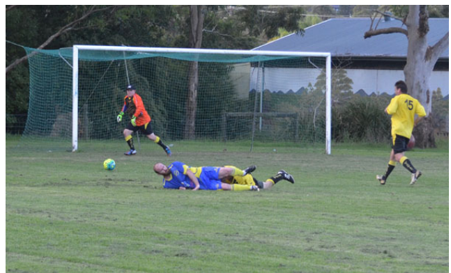
Toukley tries a new tactic to get past BURKEY.