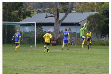
ANDY makes an early run and cross.