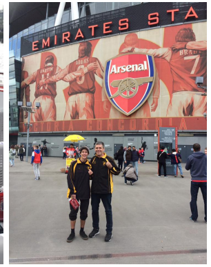
LUCA proudly promotes the club abroad.