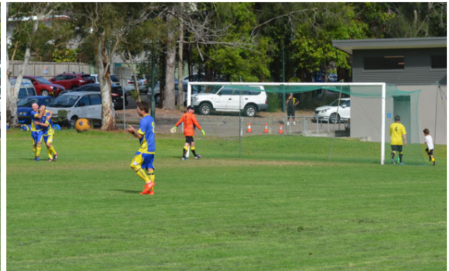
TOUKLEY picks up an early brace.