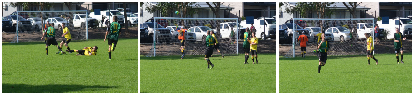
KANWAL strikes again early in the second half.