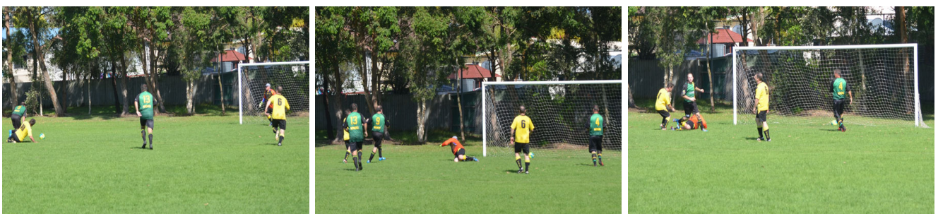
KANWAL's finally strikes !!