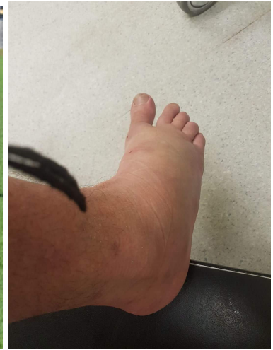
STEW plays through the pain ... and later that evening.