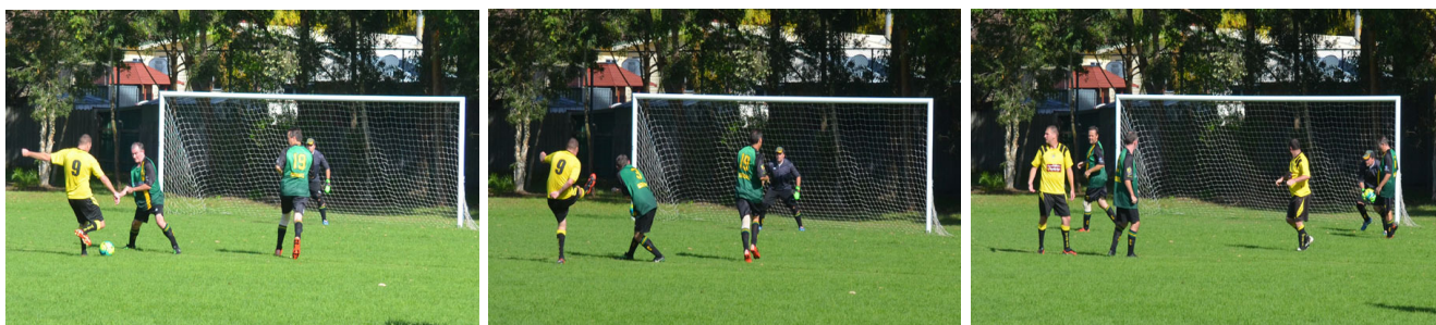
STEW takes a shot!